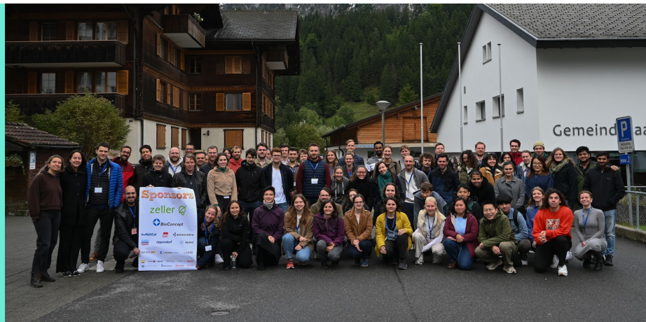
Bio- & Pharmazentrum PhD Retreat 2024

Inspire participants with cutting-edge research discussions and encourage personal and professional growth.